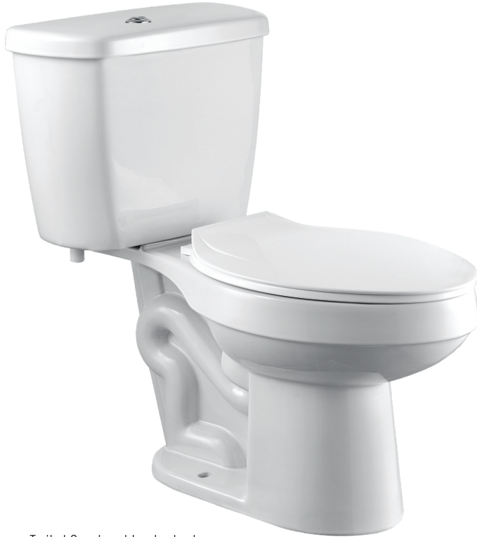
Toilet Seat not Included